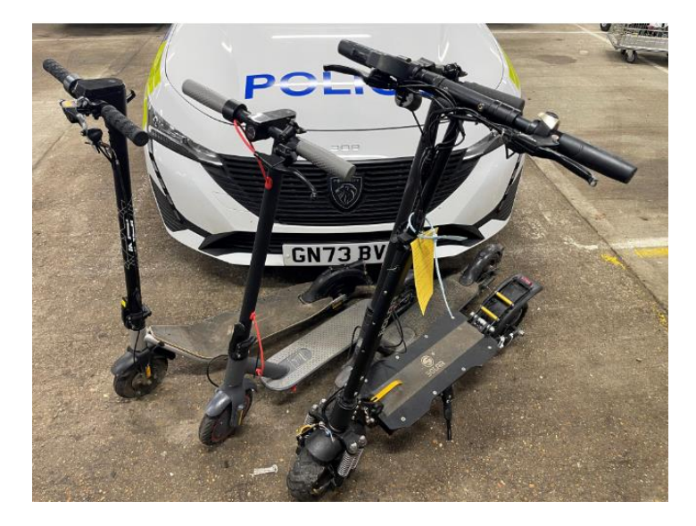
Electric Scooters – know the law

Although e-scooters can be great fun, it's <u>against the law</u> to ride one on a public road, cycle lane or pavement. Please share this information with friends and family.